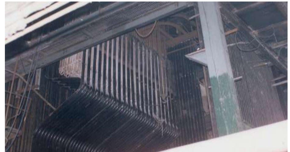
Boiler Tube Panel Erection, at: - M/s. U. P. State Sugar Corporation, Doiwala