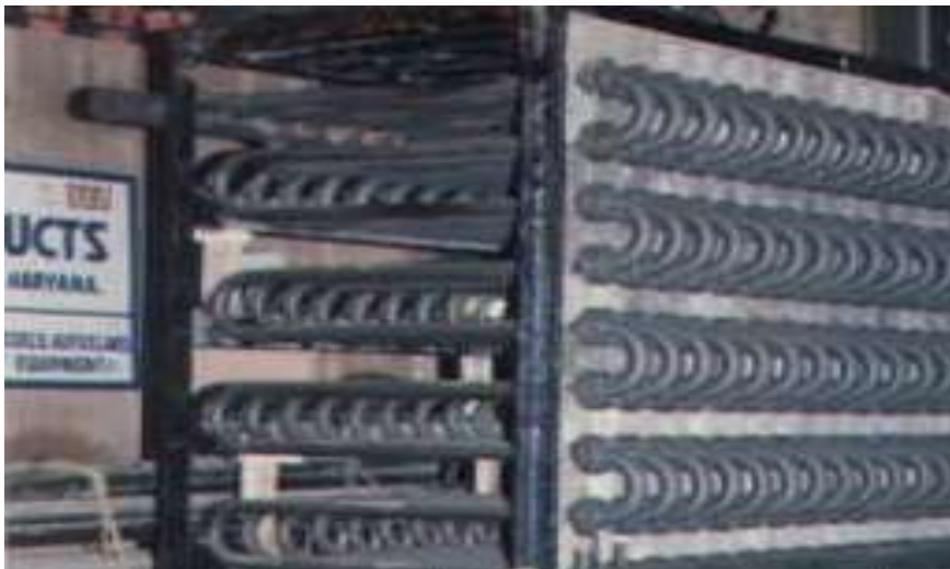
Economiser, Supplied to: - M/s. Mahesh Udyog, Una