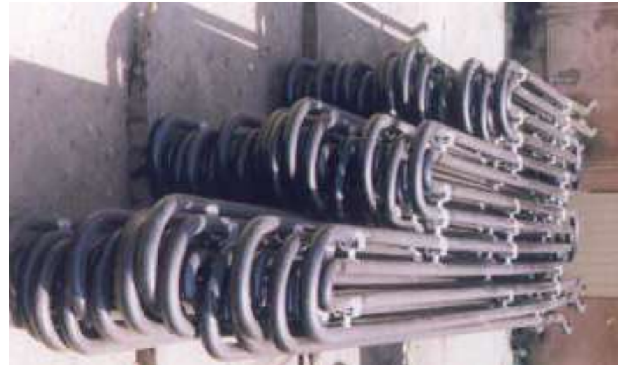
Super Heater Coils, Supplied to: - M/s. Modi Sugar Mills, Modinagar