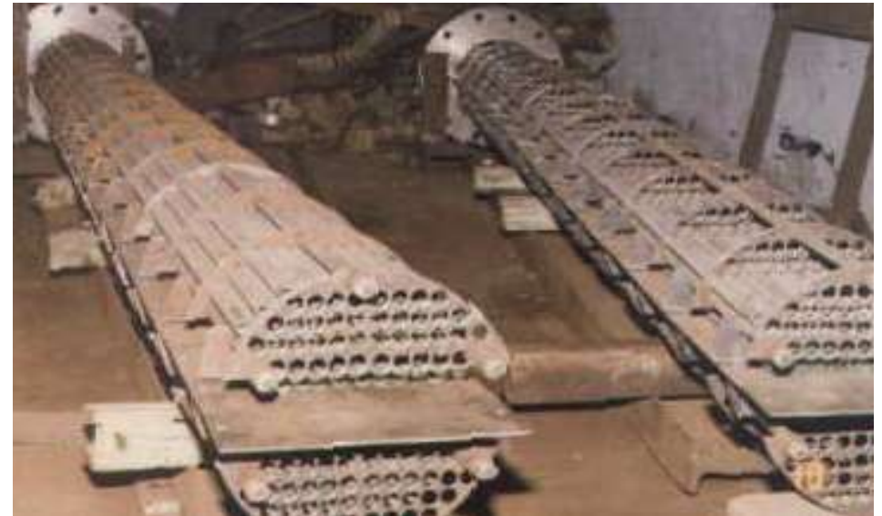
Heat Exchangers, Supplied to: - M/s. Taina River Industries, Ranchi