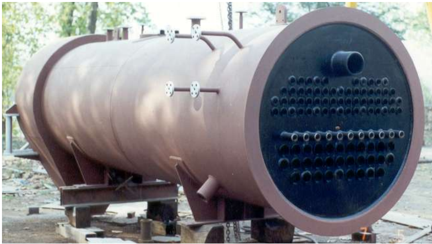
Shell for Waste Wood Fired, 2 Ton/Hr Boiler, Supplied to: - M/s. Shrinath Wood Industries, Yamunanagar

E-51, Industrial Area, Yamunanagar (Haryana) – 135001, India Ph.: +91. 1732. 250670, 251370 Fax: +91. 1732. 250990 E-mail: info@alliedalloyproducts.com ; aapyr@gmail.com