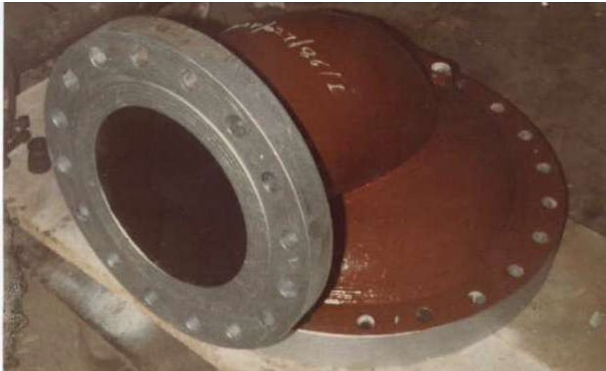
Steam Turbine Exhaust Casing, Supplied to: - M/s. Belliss India Ltd., New Delhi