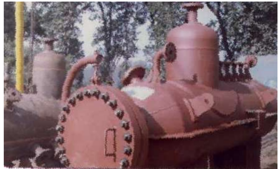
Pressure Vessels, Supplied to: - M/s. Kinetic Technologies Ltd., New Delhi