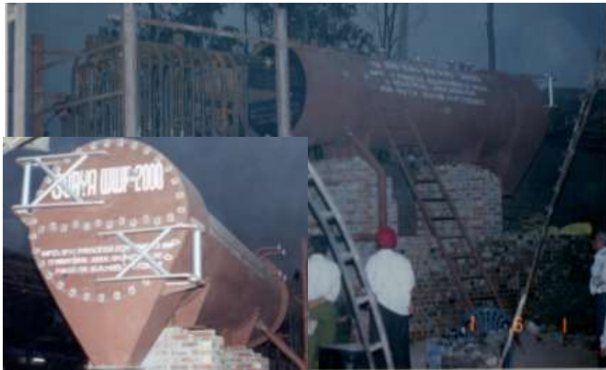
Waste Wood Fired, 2 Ton/Hr Boiler, under erection