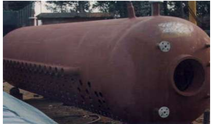
Boiler Steam Boilers, Supplied to: - M/s. Northland Sugar Mills, Dasua